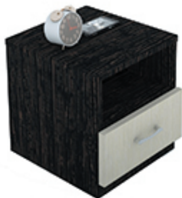
Geo W: 18" X H: 18" X D: 18"