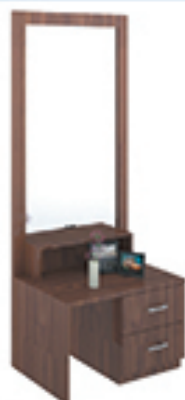
Kiara W: 30" X H: 72" X D: 18"