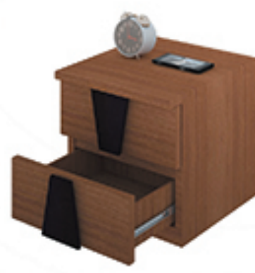
Crown W: 18" X H: 18" X D: 18"