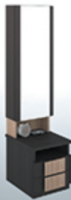
Bricks W: 24" X H: 72" X D: 18"