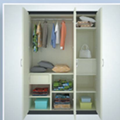
3 Door Wardrobe W: 48" X H: 78" X D: 22"