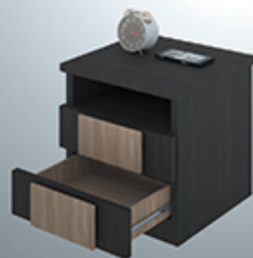
Bricks W: 18" X H: 18" X D: 18"