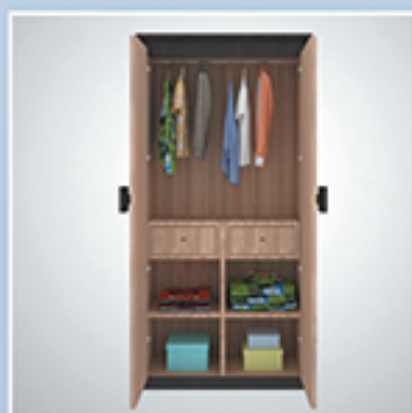
2 Door Wardrobe W: 36" X H: 78" X D: 22"