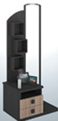
Tulip W: 30" X H: 72" X D: 18"