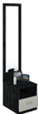
Geo W: 16" X H: 72" X D: 18"