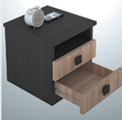
Tulip W: 18" X H: 18" X D: 18"