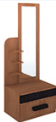
Crown W: 32" X H: 72" X D: 18"